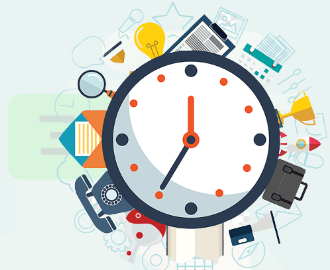
TIME & ATTENDANCE