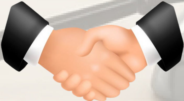
Timely Meet All Expenses