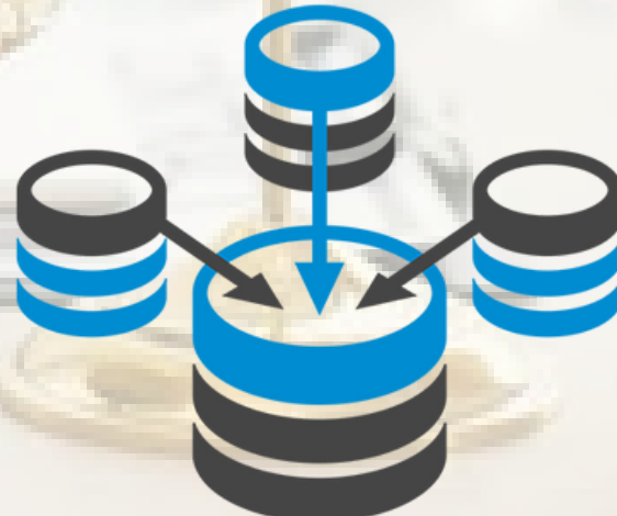
Centralized Access to Data